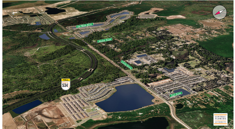
Artist's Rendering - Subject to change as the design progresses.

As part of our commitment to environmental stewardship, CFX has worked with local, regional, and state partners, as well as community and environmental stakeholders, on the design of the 1.3-mile segment within the Split Oak Forest Wildlife and Environmental Area.